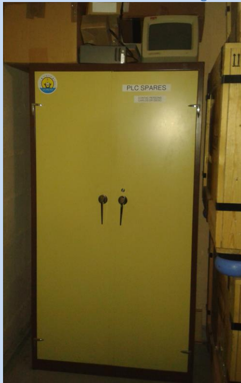
Photo 4 Spare Cabinet 1st floor