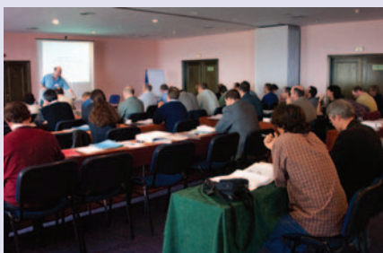
Course room at Hotel H10 Taburiente Playa, Los Cancajos.