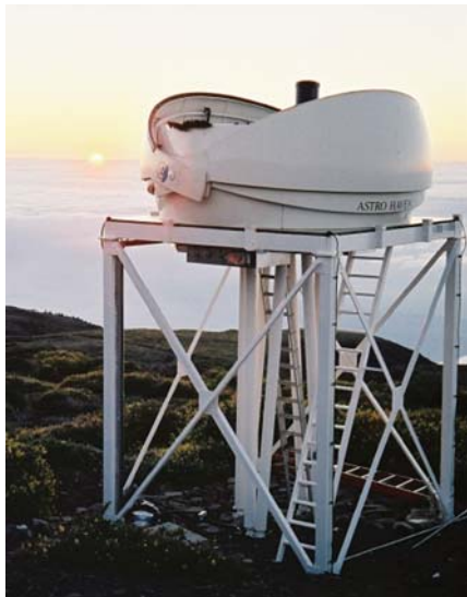
Figure 1 (left). RoboDIMM stands ready at sunset for a night's observation at the Roque de Los Muchachos observatory. The dome is opened remotely from the WHT control room and the automatic observing program is started. The tower, 5m tall, is located about 75m north of the dome of the William Herschel Telescope, on a gentle slope facing unobstructedly the prevailing winds.

RoboDIMM started observing in August 2002, to coincide with the first NAOMI "science run" at the WHT. It sampled the seeing on 85 nights until December, missing only 20% of nights, mostly due to poor weather. Around this time, a fault with a telescope drive motor began causing significant downtime. Now the motor has been replaced and RoboDIMM again accompanied the NAOMI run of April 2003. It has