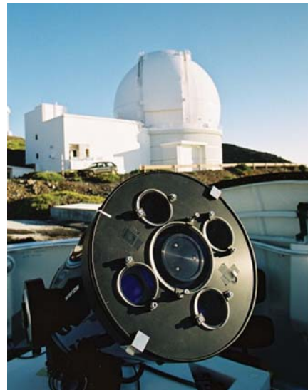
Figure 2 (right). The RoboDIMM telescope at polar park position, with the WHT in the background. The entrance aperture forms 4 separate images of the same star (the large central aperture is no longer used). The sub-apertures, covered by optical wedges, are aligned along N/S and E/W (despite what the perspective here may suggest).

continued in its routine job of seeing monitoring throughout last summer without pause.