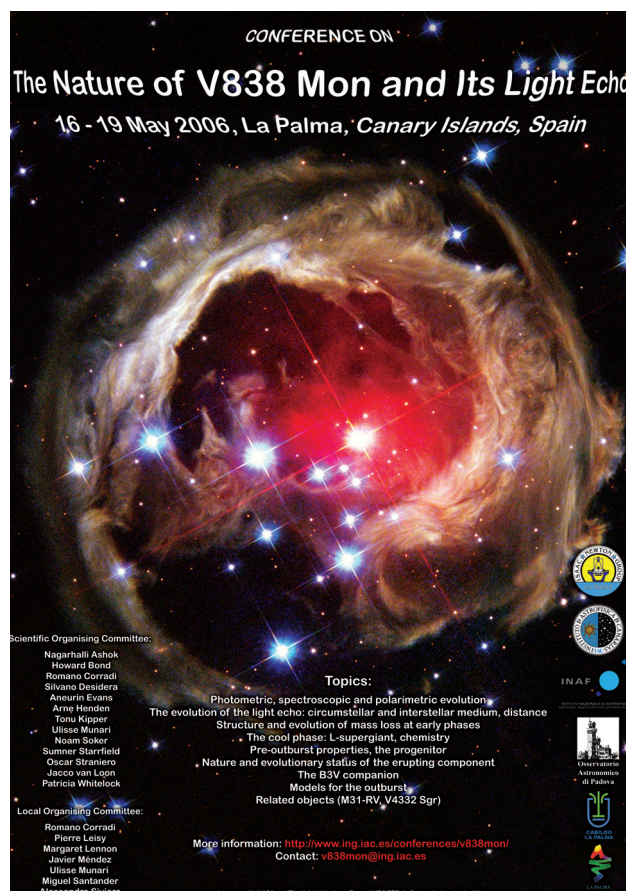
Figure 61. Poster for the conference "The Nature of V838 Mon and Its Light Echo".

The 2002 outburst of V838 Monocerotis, and its highly peculiar, fast evolution toward a very low photospheric