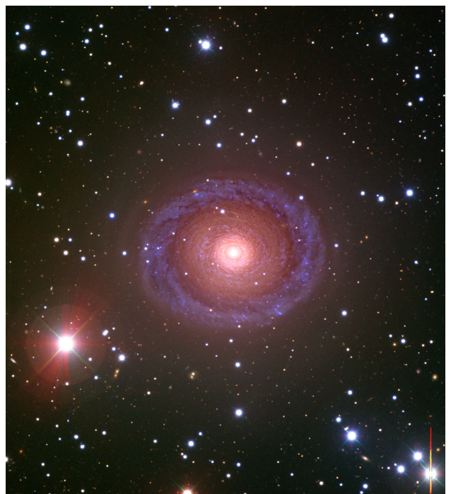
Figure 62. Top: Image of M81 galaxy obtained using the Wide Field Camera on the INT. Bottom: NGC 7271 galaxy as observed with the Prime Focus camera on the WHT. Both images were incorporated to ING's public archive of images.