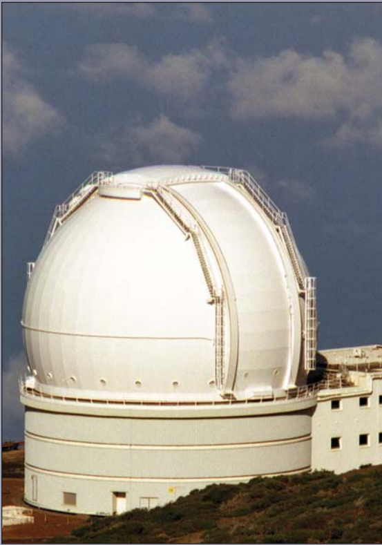
William Herschel Telescope