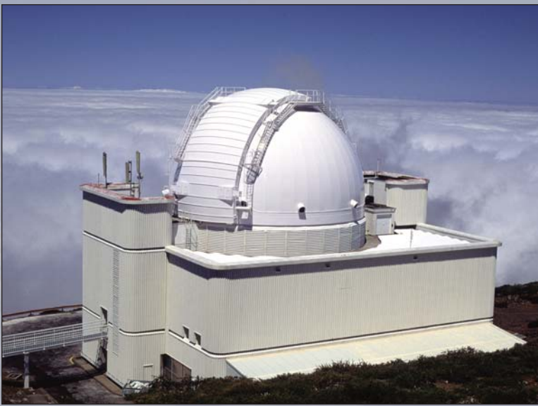
Isaac Newton Telescope