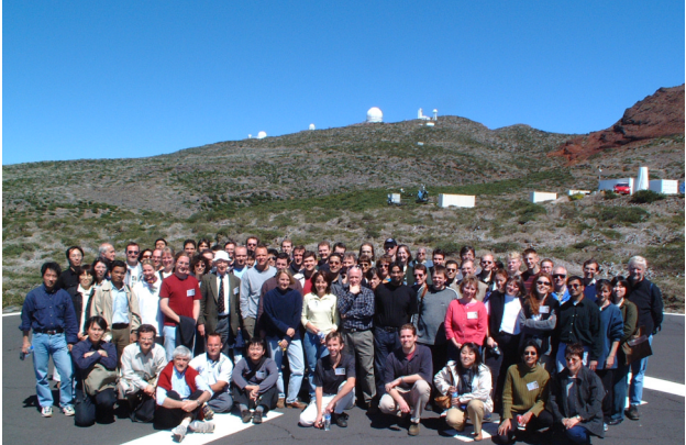
Figure 2. Above: Announcing poster of the "The Central Kpc of Starbursts and AGNs: The La Palma Connection" conference. Below: Conference attendants at the Observatory.

speakers such as Ellis, Pettini, Foy, Davies, Charles and de Zeeuw), a vigorous visitor programme, and staff effort available for long-term student supervision. The last point is noteworthy as long-term students provided support for the JKT, releasing valuable effort for ING projects and research.