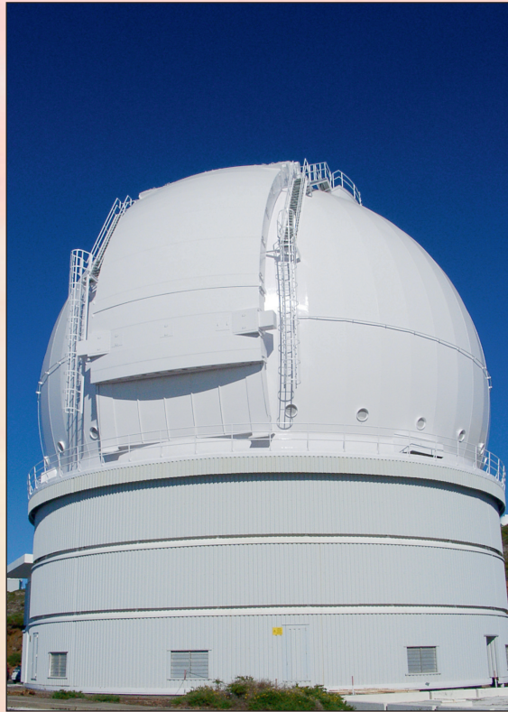
William Herschel Telescope