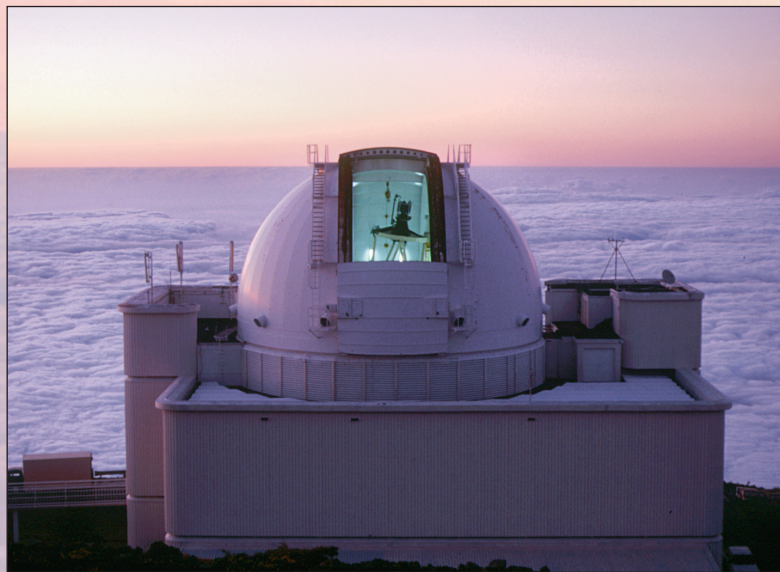
Isaac Newton Telescope