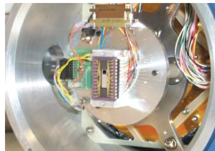
Figure 1 (left). Potential L3 gains in NAOMI. Thanks to Richard Wilson for providing Figure 1. Figure 2 (right). The L3 Test Camera.