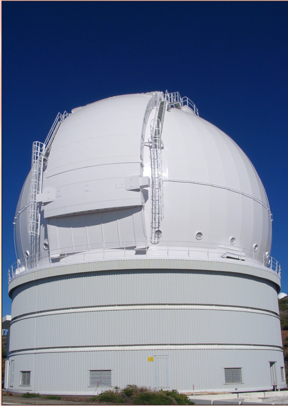
William Herschel Telescope