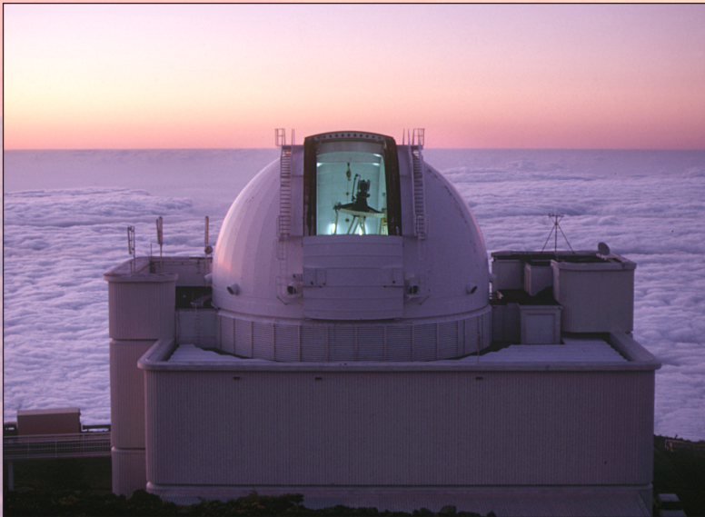
Isaac Newton Telescope