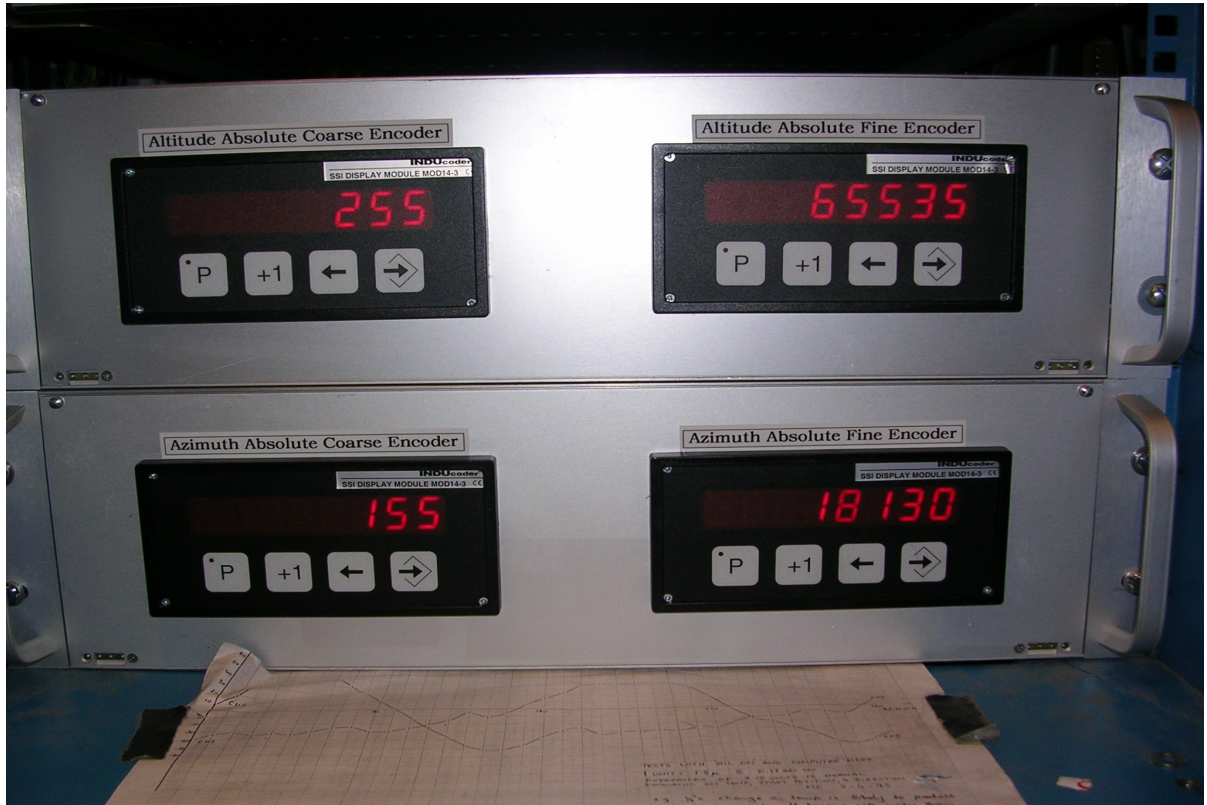
Afbeelding 3: Absolute encoder display boxes in control room