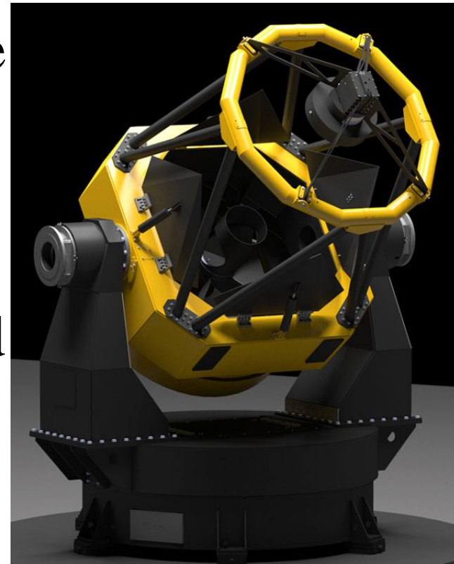
1.4 m Astelco telescope