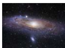
The Andromeda Galaxy

Astronomers from UK Universities working with colleagues from Germany and Australia have calculated that the Universe is actually twice as bright as previously thought. In the latest Astrophysical Journal Letters (10th May), the astronomers describe how dust is obscuring approximately half of the light that the Universe is currently generating.