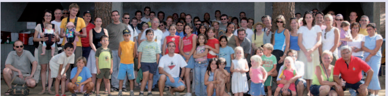
A big family. This photograph was taken during our summer barbecue in the Refugio de El Pilar, La Palma, and it shows members and relatives of some of the La Palma-based staff from GTC, ING, TNG, NOT and Mercator. Indeed, a family photograph.